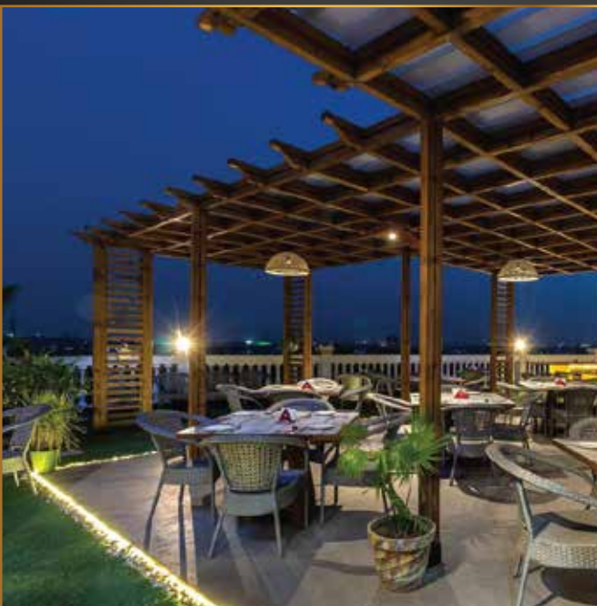
Rooftop Restaurant with Garden